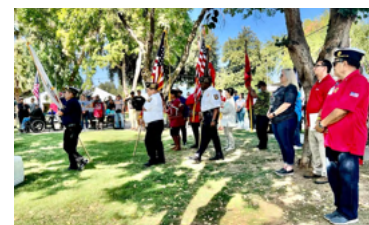
9.14 - 15: The 32nd Annual Central Valley Veterans Stand Down

Our San Joaquin Valley Veterans (SJVV) participated in the 32nd Central Valley Veterans' Stand Down that took place from Sept. 14 - 15 at the VFW Post 8900 in Fresno. Every year, this event provides a wide variety of resources and/or services to our Veterans such as mental and physical health referrals, help with legal documentation, clothing, hot meals, free haircuts, personal hygiene kits, and temporary shelter. Although the event opened to the public on the morning of Sept. 14, unhoused Veterans were welcomed to spend the night through the 15th in tents supplied with cots. Showers were also available. Thank you, SJVV and all organizations involved in this event for your commitment to helping our nation's heroes!