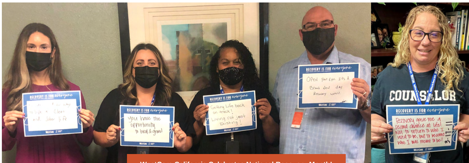
WestCare California Celebrates National Recovery Month!

September marked National Recovery Month and our WestCare California family was proud to join WestCare's nationwide family of programs and services as part of the Recovery is for Everyone campaign to share what recovery means to them! Here's just a few of the heartfelt sentiments that we received: