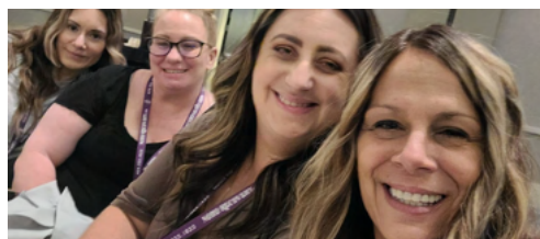
9.16 - 18: 2022 CADE Conference

Our San Joaquin Valley Veterans (SJVV) participated in the 32nd Central Valley Veterans' Stand Down that took place from Sept. 14 - 15 at the VFW Post 8900 in Fresno. Every year, this event provides a wide variety of resources and/or services to our Veterans such as mental and physical health referrals, help with legal documentation, clothing, hot meals, free haircuts, personal hygiene kits, and temporary shelter. Although the event opened to the public on the morning of Sept. 14, unhoused Veterans were welcomed to spend the night through the 15th in tents supplied with cots. Showers were also available. Thank you, SJVV and all organizations involved in this event for your commitment to helping our nation's heroes!