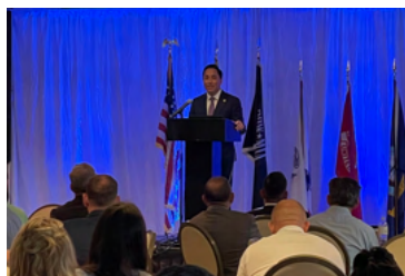
9.11 - 14: The 2022 CalVet Leadership Summit