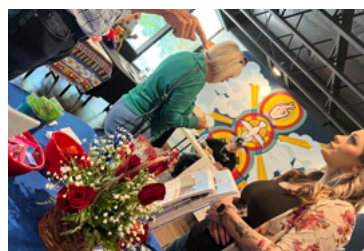
9.17: The 5th Annual Fresno &amp; Clovis Recovery Summit

We were proud to once again be a part of the Fresno & Clovis Recovery Summit at First Street Church! This year, we were represented by staff on behalf of our Fresno Adult Outpatient and MLK Residential programs. Thank you, ladies, for attending and sharing about the life-changing services that we are so proud to offer for men, women, parolees, and families!